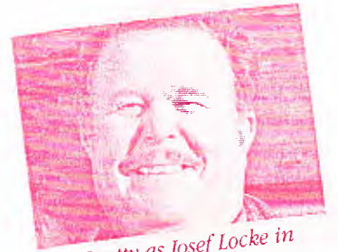
Ned Beatty as Josef Locke in Hear My Song .

Affiliated to the British Federation of Film Societies and the British Film Institute